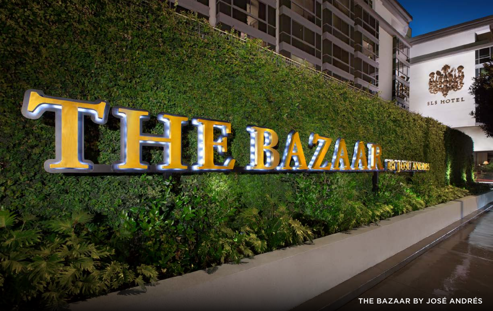
THE BAZAAR BY JOSÉ ANDRÉS