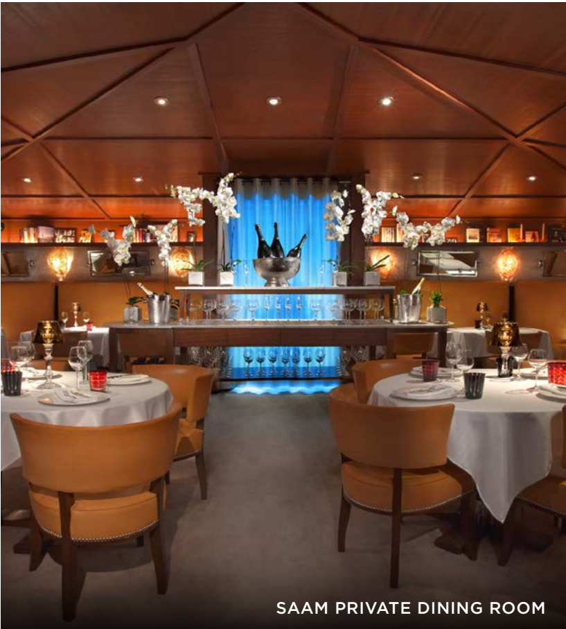
SAAM PRIVATE DINING ROOM